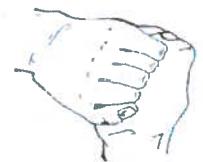
4. Backs of fingers to opposing palms with fingers interlocked