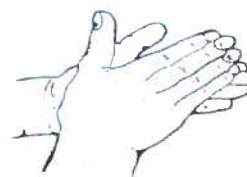
1. Palm to palm