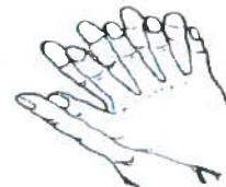
3. Palm to palm fingers interlaced