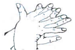
2. Right palm over left dorsum and left palm over right dorsum