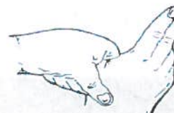
5. Rotational rubbing of right thumb clasped in left palm and vice versa