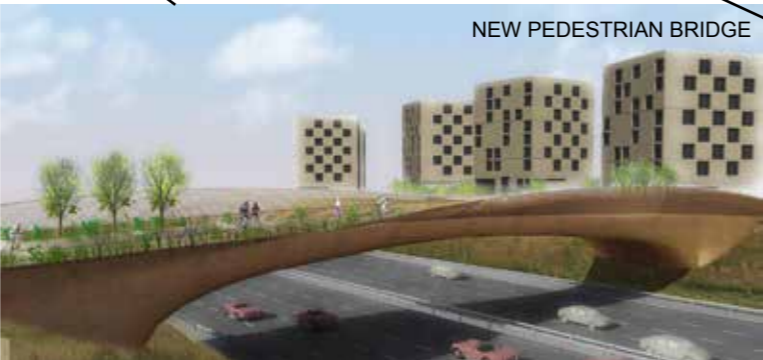
NEW PEDESTRIAN BRIDGE