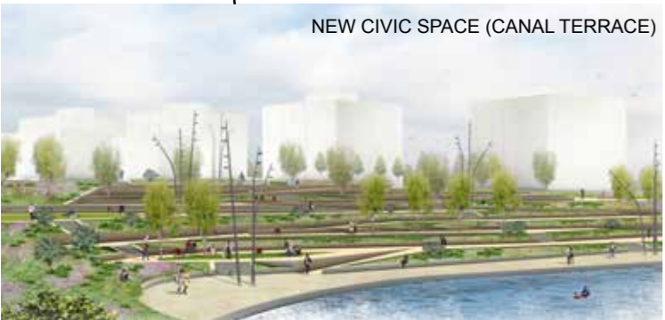
NEW CIVIC SPACE (CANAL TERRACE)