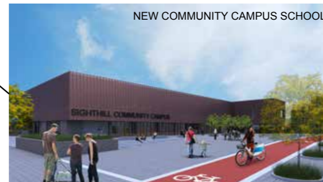
NEW COMMUNITY CAMPUS SCHOOL