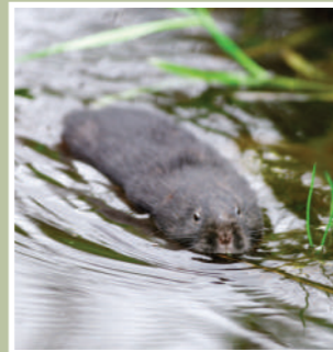
A wetland water vole at home in the water

Wetland water voles live near slow flowing or still water. They can be found in ditches, burns, ponds, marshes and canals with long vegetation. They have burrows in the bank and feed on wetland plants including grasses, sedges and rushes.