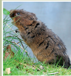
A grassland water vole