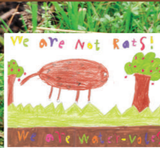
Artwork by Avenue End Primary School