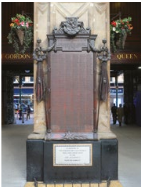
Glasgow Central Station War Memorial (now central station). 2013

Central Station, Gordon Street, Glasgow, G1 3SL