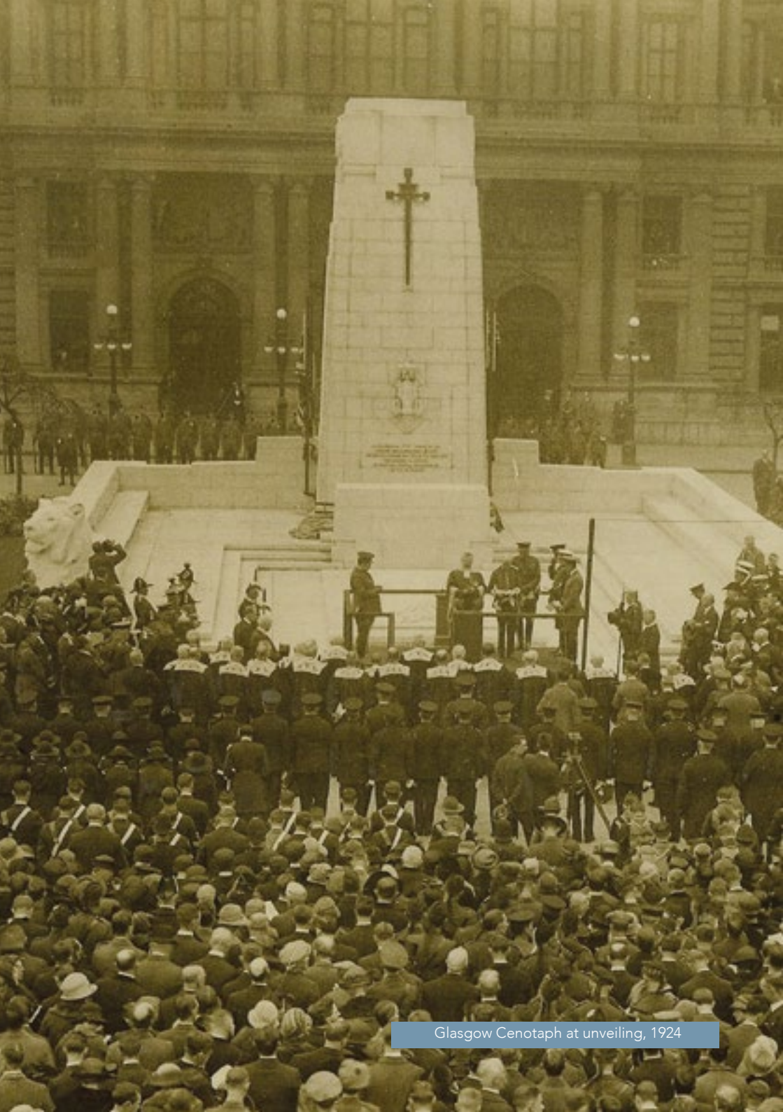
Glasgow Cenotaph at unveiling, 1924