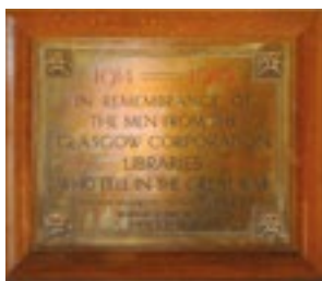
Mitchell Library plaque. 2013