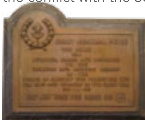
Scout Memorial House. 2013

This building on Elmbank Street was acquired, named and dedicated to the Scouts of Glasgow who served during the First World War. A large number of former Scouts and Leaders from the city took part in the conflict with the Scout Roll of Honour (available online through the