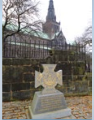
Kirk Lane Victoria Cross Memorial. 2013