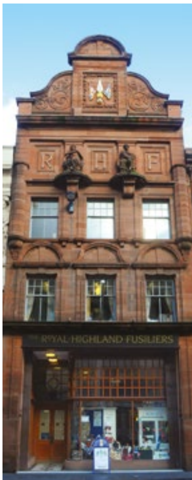
Royal Highland Fusiliers Museum. 2013

The Royal Highland Fusiliers were formed in 1959 by the amalgamation of the Royal Scots Fusiliers (R.H.F) and the Highland Light Infantry (H.L.I.). This regimental museum documents their separate and combined existence dating back to 1678. The H.L.I. were traditionally raised from the Glasgow area and during the Great War three Service Battalions were formed in the city, the 15th (Tramways) and the 16th (Boys Brigade) by the Glasgow Corporation alongside the 17th (Chamber of Commerce). Inside the museum are a fine selection of items relating to the conflict from original uniforms and early gas masks to the flag flown in battle by the 10th Battalion H.L.I.. Showing the terrible reality of war, a captured German machine gun sits alongside a collection of medical equipment from Dr. Dunbar, the medical officer to the 6th Battalion Royal Scots Fusiliers. A series of 'In their own words' displays and copies of Quartermaster Sergeant William Schlater's letters to his mother and his future wife help bring the action to life on a human scale.