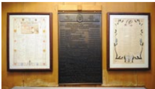
Royal Infirmary Memorial. 2013

Glasgow Royal Infirmary, Centre Block. 84 Castle Street, Glasgow G4 0SF