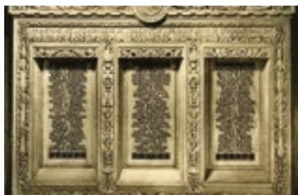
Bank Of Scotland War Memorial . 2013