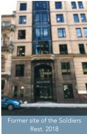
Former site of the Soldiers Rest. 2018

"A 'Haven of rest' for Tommy" was how the Evening Times on the 9 August, 1915 described this rest home and club for soldiers and sailors at 54 West Nile Street. Independently run on a voluntary basis by several individuals, the former office was transformed into a place for recreation and relaxation. It was furnished with gifted items and the facilities included "a cosy reading room supplied with papers and magazines, a writing room, a recreation room with games and a piano, a dining room where refreshments are served at moderate prices and even a tiny garden".