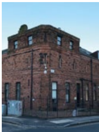
Haldane Building, Rose Street. 2018

Haldane Building, Rose Street, Glasgow, G3 6RN