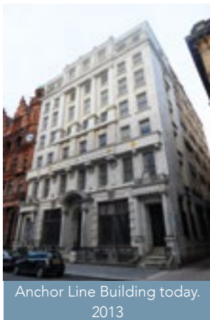
Anchor Line Building today. 2013

12,14,16, St Vincent Place, Glasgow, G1 2EU