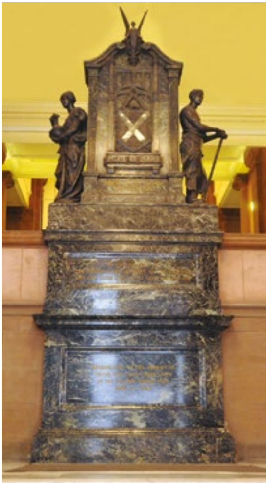
Royal Technical College Memorial

University of Strathclyde, Royal College. 204 George Street, Glasgow, G1 1XW