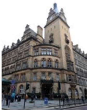
Glasgow Central Hotel. 2013

This hotel fronting the railway station was extended in 1901 by the Scottish architect James Miller. He also designed the North British Locomotive Company offices in Springburn (used as a Red Cross Hospital, see North Glasgow Trail) and the Anchor Line building (site 41). The military elite would often congregate here during the war and the hotel staff would attend to the needs of the officers sleeping on the station concourse awaiting transportation to the front.