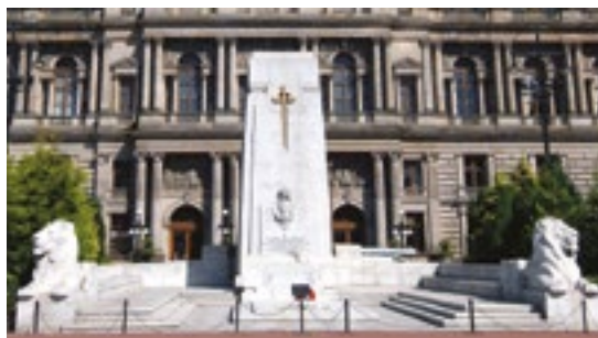
City Chambers (with cenotaph in foreground). 2013

Accompanying the Cenotaph is a Lamp of Remembrance and the WW1 Roll of Honour located within the entrance hall of Glasgow's council headquarters, the City Chambers. This documents the name, rank, regiment and address of the 17,695 of men from the city who failed to