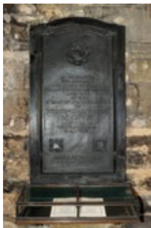
Glasgow Cathedral Highland Light Infantry Memorial. 2013

Cathedral Square, Castle St, Glasgow, G4 0QZ