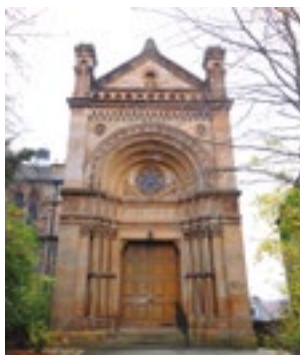
Garnethill Synagogue. 2013

This synagogue contains an ornate marble tablet listing the 97 names of the congregation who served during the First World War including 17 who died. In total around 1200 Jewish Glaswegians enlisted with 86 losing their lives. At the memorial's unveiling on the 12 December, 1920 the Lord Provost noted that "no section of the community had taken up arms more willingly than the Jews in Glasgow". Some of the names on the tablet can also be found on stones at the Garnethill Hebrew Burial