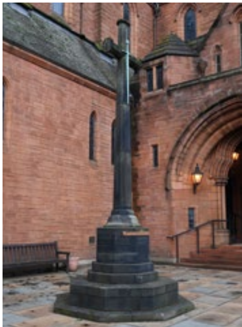
Barony Hall Cross of Sacrifice. 2018

This sandstone Cross of Sacrifice exists behind railings outside the south east corner of JJ Burnet's church. Religious symbols were often used as a way to provide comfort to the bereaved through attributing a greater meaning to the loss. The bronze sword attached to the face of the monument points downwards, reflecting the form of the cross whilst representing the conflict as that of a religious crusade. It was designed by the well known architect Peter MacGregor Chalmers who produced several other war memorials such as those in Crieff and Ardrossan.