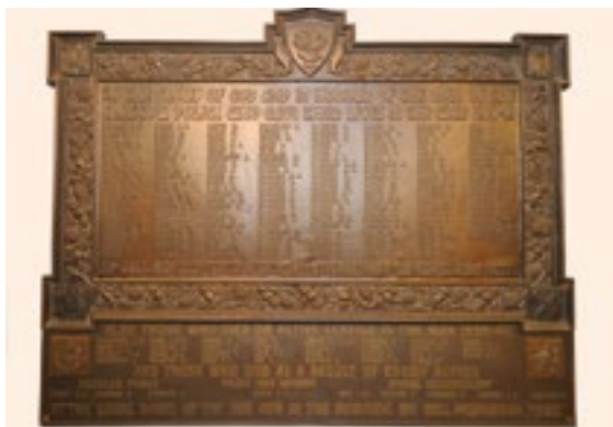
Glasgow Police Museum Memorial. 2013

1st Flr, 30 Bell Street, Merchant City, Glasgow, G1 1LG