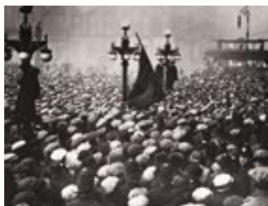
George Square, Bloody Friday, 1919

George Square, George Street, Glasgow, G2 1DU