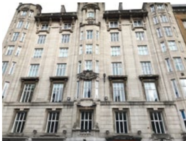
Former site of the Recruiting Office. 2018

In August 1915 the Northern Assurance company donated the use of their premises at 84 St Vincent Street to the 5th Battalion Cameronians (Scottish Rifles) for use as a recruiting office. Such offices had sprung up across the city but interestingly this battalion sought to encourage potential