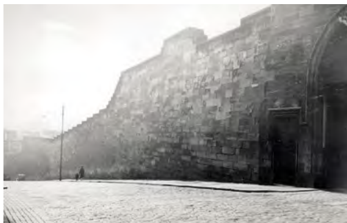
Duke Street Prison Walls, 1959

Further along Duke Street towards the city centre was once Duke Street Prison, now the Drygate housing estate that remains now are the old walls at the back, up the hill, behind the flats. This was one of only two main prisons within Glasgow City itself at the time and by the outbreak of war, exclusively, a woman's prison. As such it