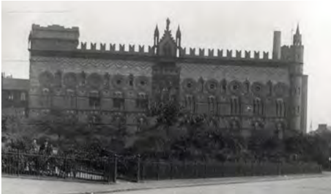
Templeton's Carpet Factory, 1914