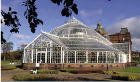
People's Palace, 2013

The jewel in Glasgow Green's crown is the magnificent People's Palace and Winter Gardens. This museum exhibits many items related to the history of Scotland and Glasgow specifically, with a focus on social history. The current lineup of exhibits includes First World War Posters as well as