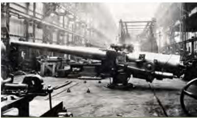
Beardmore Naval Gun, WW1

William Beardmore & Company was a powerhouse of Scottish industry, an engineering conglomerate of vast proportions. The company's Parkhead Forge, in conjunction with the Govan and Dalmuir shipyards made a huge contribution to the war effort through the manufacture of warships, tanks, aeroplanes and guns. 3500 field guns, 69 ships totalling 118,089 tons and the British army's steel helmets were just some of the fruits of the organisation's labour along with the track shoes and armour plates for the nation's tanks. As production boomed, so did the workforce and by 1915 the Forge