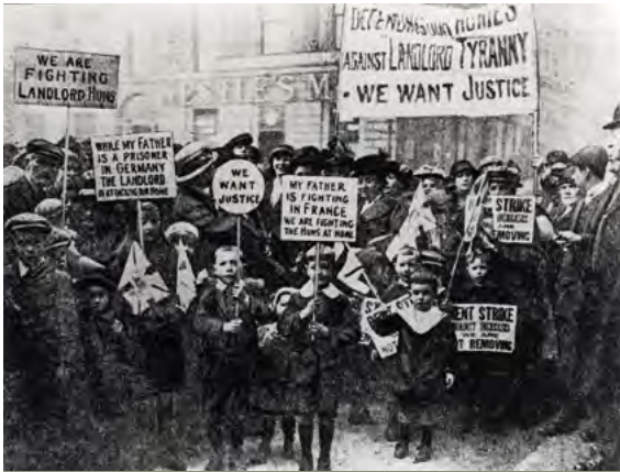
Rent Strike Protestors, 1915

Opp. 125 Greenhead Street, Glasgow G40 1HT