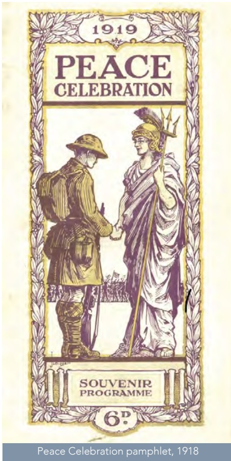
Peace Celebration pamphlet, 1918

From the peace movement protesting during the war to peace celebrations following the Armistice. But with celebrations of peace came commemorations of those who gave their lives and Glasgow Green was the focus of these emotions for many Glaswegians following the end of the fighting. A subdued gathering was to occur in 1919 as part of the city's Peace Celebration when a temporary war memorial, a precursor to the Cenotaph in the form of a timber cross was constructed. A permanent monument can be found to the south within McPhun's Park/ Dassie Green. This celtic cross commemorates those men of the 7th (Blythwood) Battalion Highland Light Infantry who died during the war.