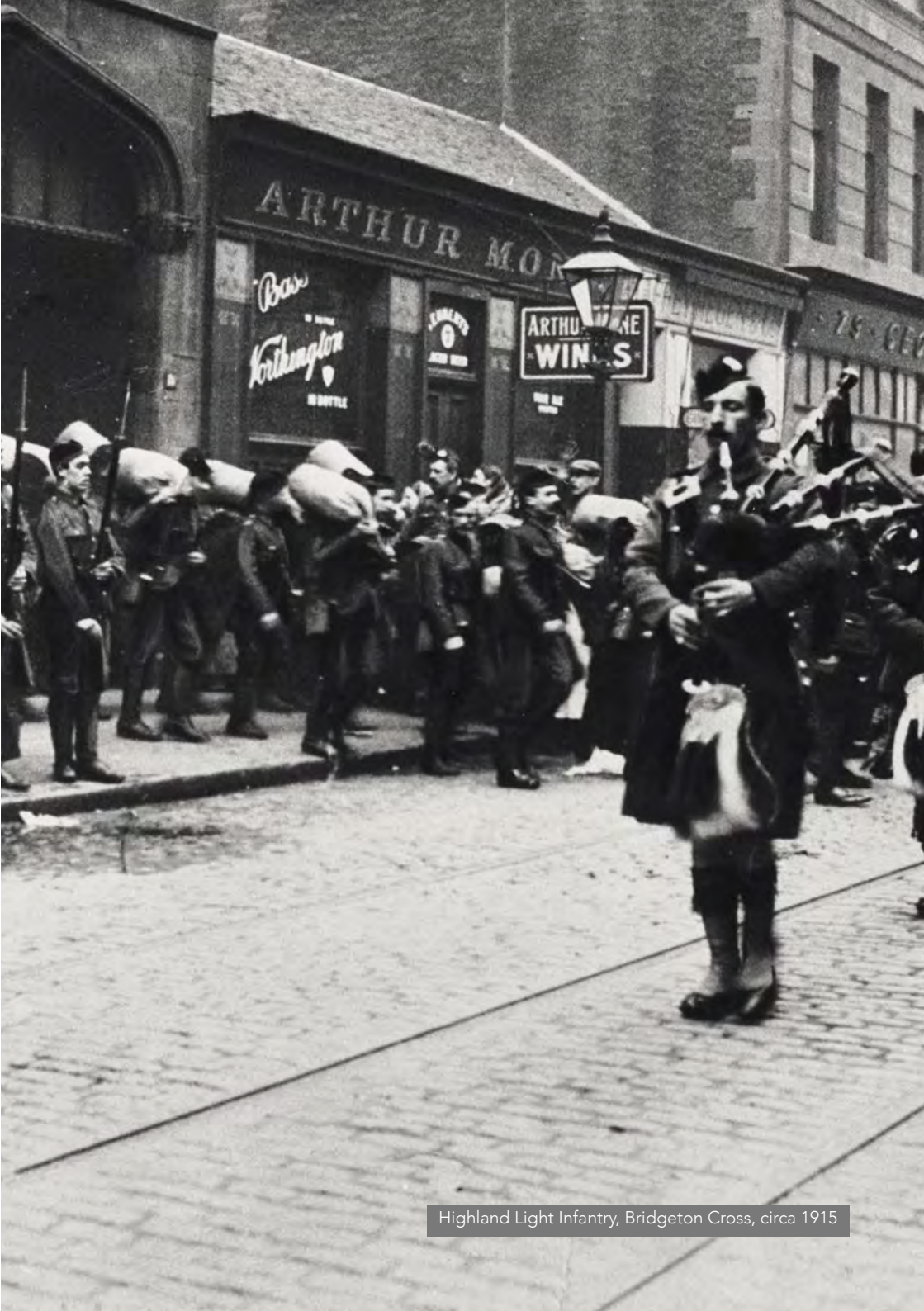
Highland Light Infantry, Bridgeton Cross, circa 1915