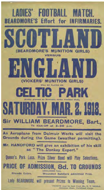
Celtic Park football match poster, 1918

Celtic Football Club was founded to be a football club for the Irish community in Glasgow and while there were members of the Irish community who disagreed with the war, many more enlisted in the British military. Celtic FC regularly supported charities through fundraising events such as the pioneering ladies football match played at the stadium on the 2nd of March 1918. This pitted women workers from the Beardmore munitions factory in Parkhead against their counterparts from Vickers in Barrow-in-Furness. A great match of Scotland versus England commenced with Scots unfortunately losing 4-0. In September of the same year, 22,000 attended a sports day to raise money for hospitals in France and each week servicemen would be admitted free to home matches. On another occasion an