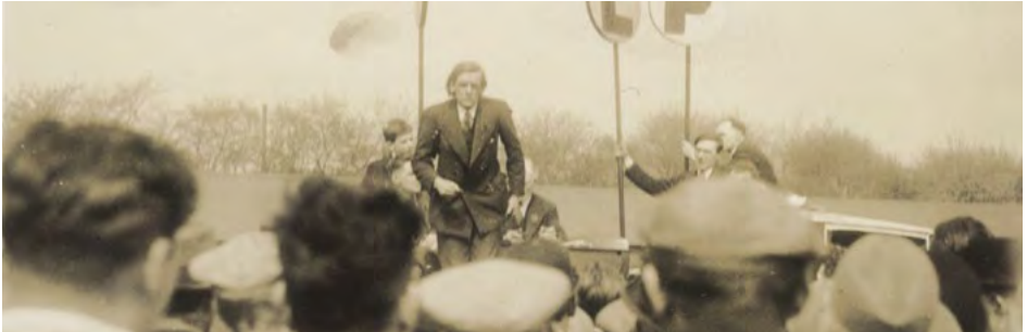
James Maxton addresses rally, circa 1910s

London Road/Bridgeton Cross, Glasgow G40 2QH