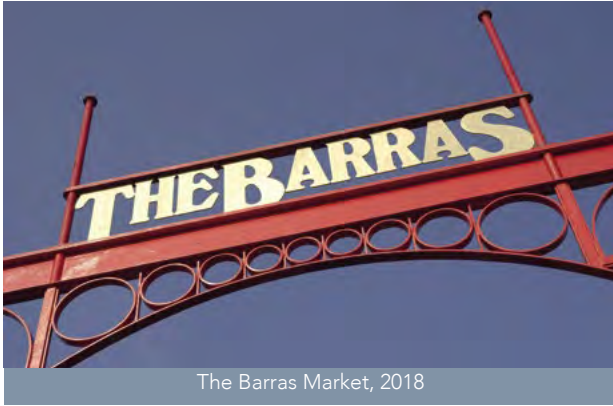
The Barras Market, 2018

Barras Market, Bain Street, Calton, Glasgow, G1 5AX,