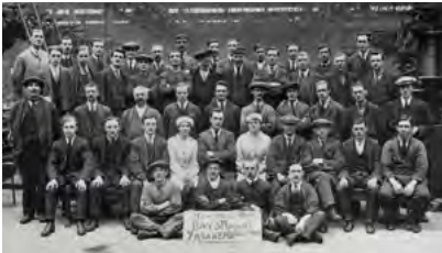
Beardmore Howitzer department, WW1