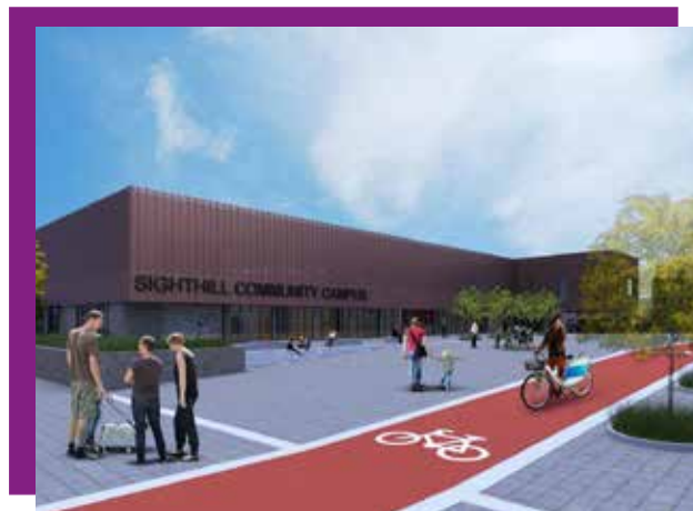
Sighthill Community Campus