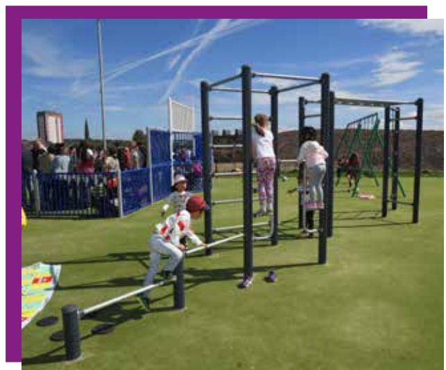
Multi Use Games Area

Junction Temporary Traffic Management will be in place from August 2019 until June 2020.