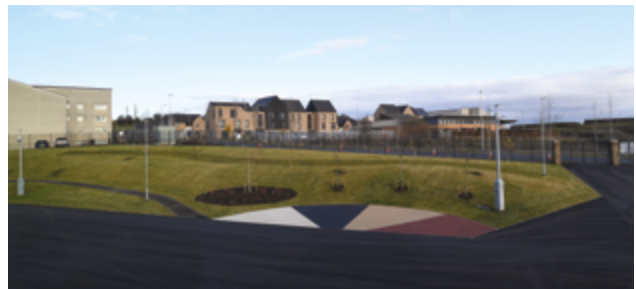
New Community Campus

Activities that you can take part in at the Youth Club include pool, table tennis, games console, Arts & Crafts, Internet Cafe, Gym activities including Dancing, Badminton and Football.