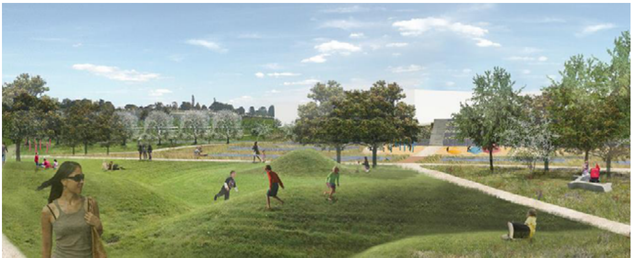
Sighthill Park Area