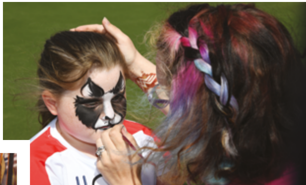
Face painting at our Summer Fun Day

New Rhythm For Glasgow NRFG held a successful Summer Fun Day with food, bouncy castle and silent disco on 21 June 2019 in Kids and Adults Together in Sighthill with support from Glasgow City Council, Glasgow Housing Association, Morgan Sindall and Keepmoat Homes and Community