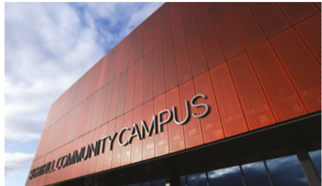
New Community Campus

The new campus also has new facility for the