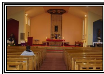
St Gabriel's Parish

In Roman Catholic denominational schools, our Catholic Liturgy shapes the nature and frequency of religious observance activities in the classroom and in the wider school community. So, at times, children and young people will be invited to participate in, and sometimes to lead prayer and reflection in classrooms and at assemblies. At other times, to honour particular occasions or feasts, chaplains will lead school communities in the celebration of Mass and other forms of liturgical celebration.