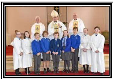
Diamond Jubilee Mass