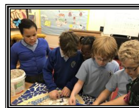
Pupils helping to create our Jubilee Mosaic

We have an amazing School Choir for pupils in Primary 4 -7 and children are encouraged to perform at a variety of musical and fundraising events. This has included raising funds for the Ronald McDonald House Charity at the St Enoch's Centre.