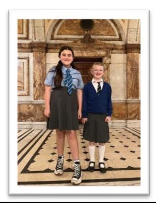
Two members of our Pupil Voice Committee at the Pupil Forum

Pupil voice is an essential vehicle for creating a positive learning climate. Within our school we promote pupil participation and active voice in a range of ways. We have an active Pupil Council, Rights Group, Learning Committee, Sports, ECO, Health and Wellbeing, Road Safety, House Captains and Vice Captains. This gives children the opportunity to promote 'pupil voice' in different ways, shape improvement and learn valuable skills for life and work.