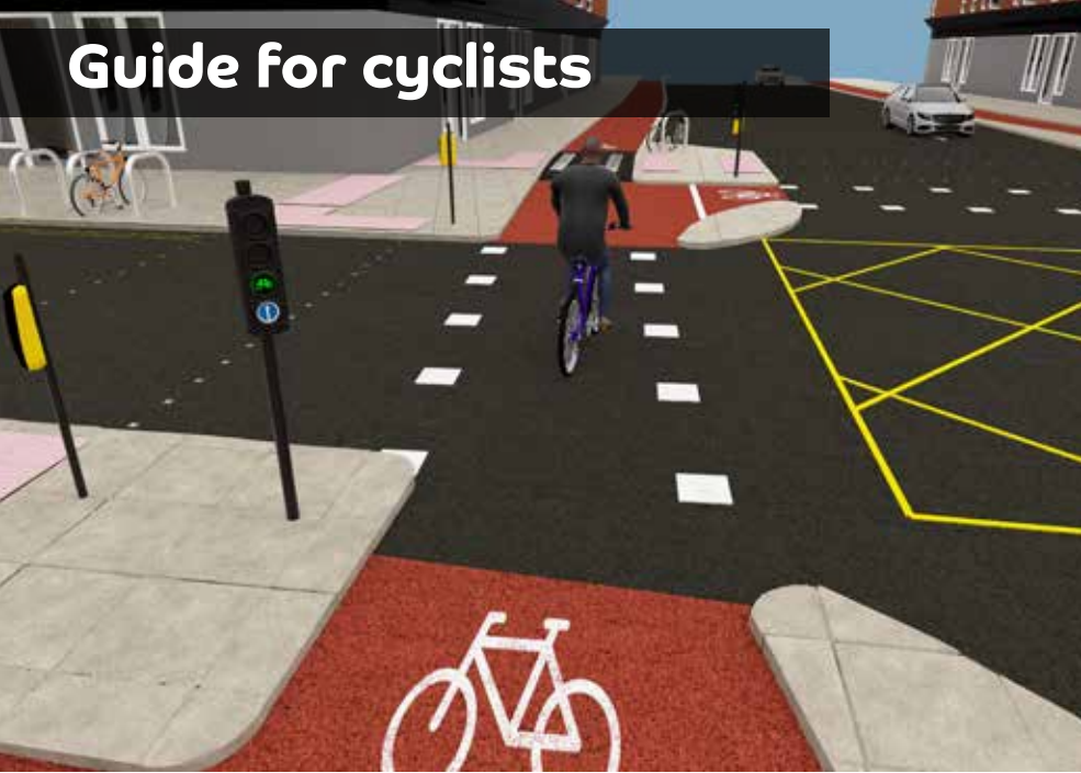
Cycle lane zebra crossing