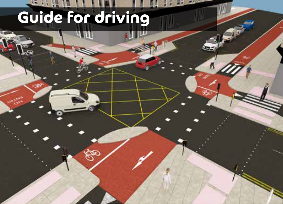
New traffic signal sequence