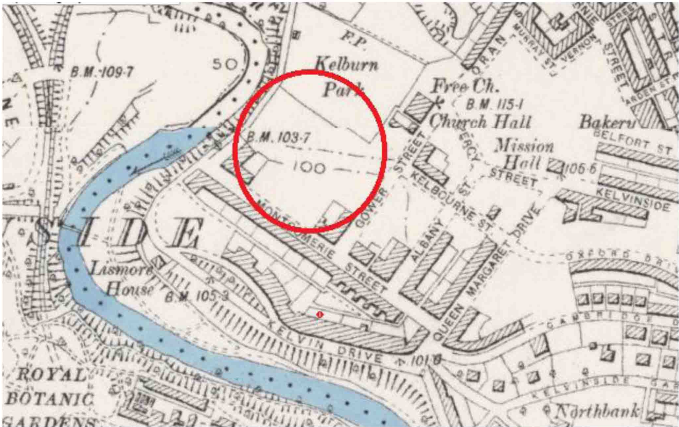
Map 2: 2 nd edition OS plan (Dunbartonshire sheet XXV N.E. & XXVI N.W., published 1899 showing the approximate location of the site circled in red