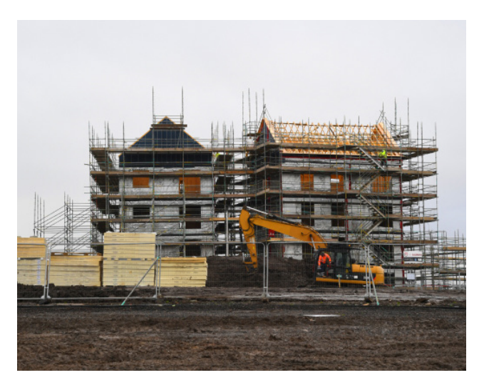
Keepmoat homes prior to Covid-19w