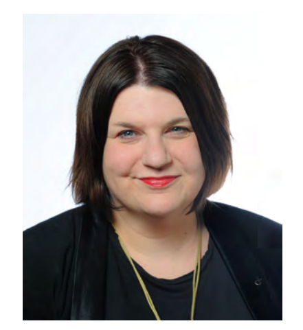
Councillor Susan Aitken Leader of Glasgow City Council

WELCOME to the Public Performance Review 2022.