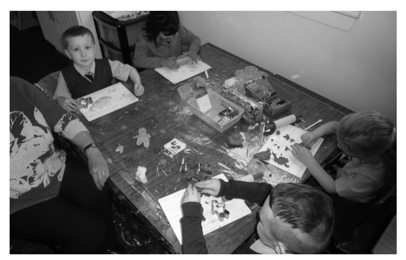
Expressive arts: The inspiration and power of the arts play a vital role in enabling our children and young people to enhance their creative talent and develop their artistic skills.

Health and wellbeing: Learning in health and wellbeing ensures that children and young people develop the knowledge, understanding and skills which they need now and in the future to help them with their physical, emotional and social wellbeing.