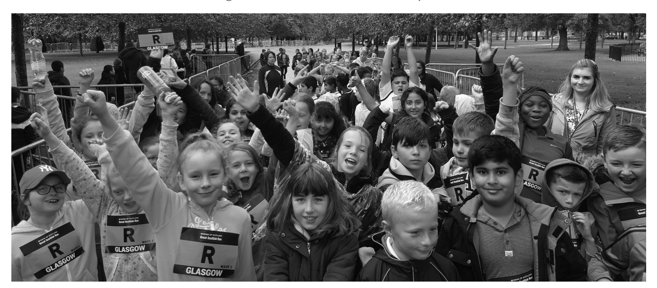
Social Studies: Through social studies, children and young people develop their understanding of the world by learning about other people and places both past and present, societies, their beliefs and values.

Science: Science and its practical application in healthcare and industry is central to our economic future, for our health and wellbeing as individuals and as a society.