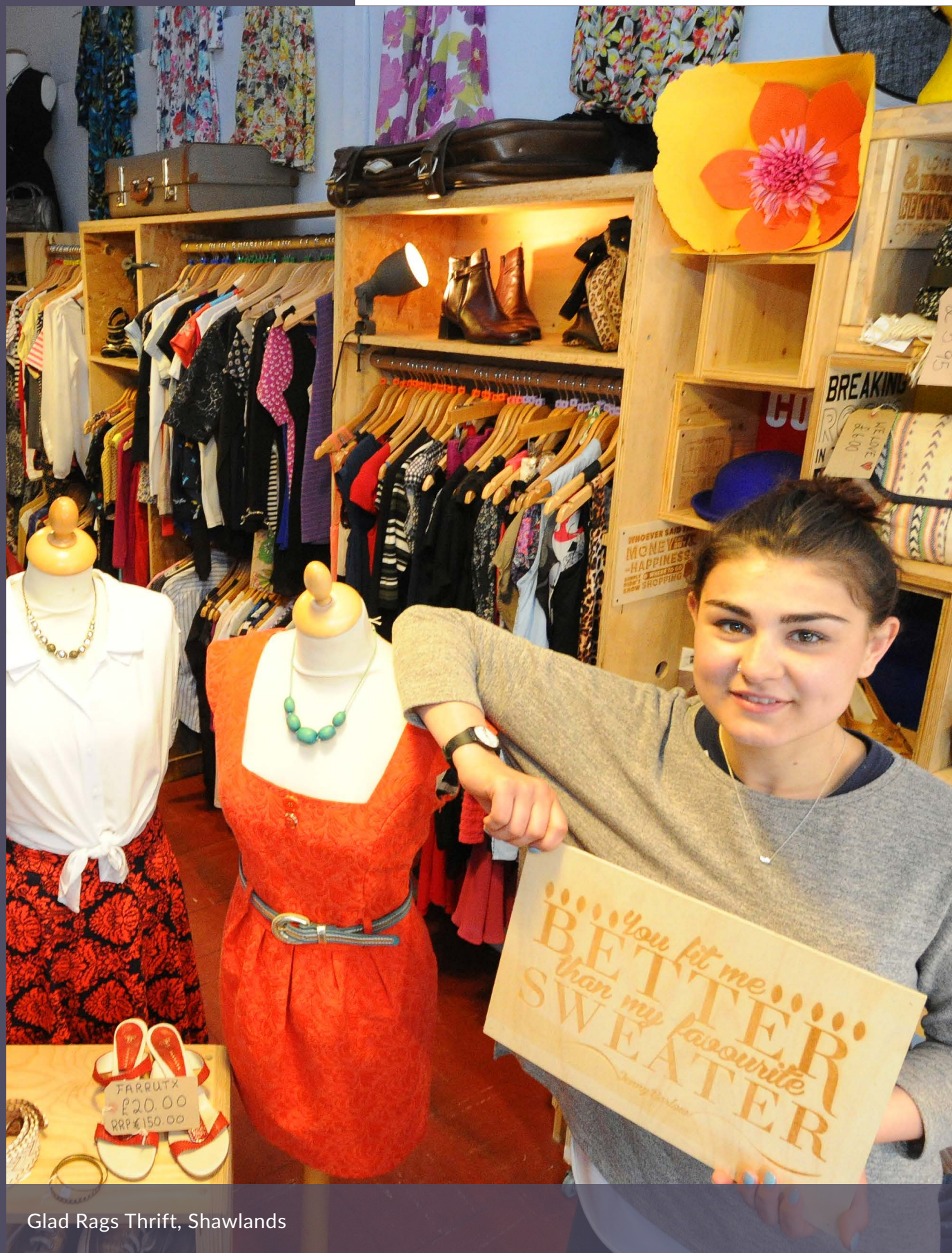
Glad Rags Thrift, Shawlands