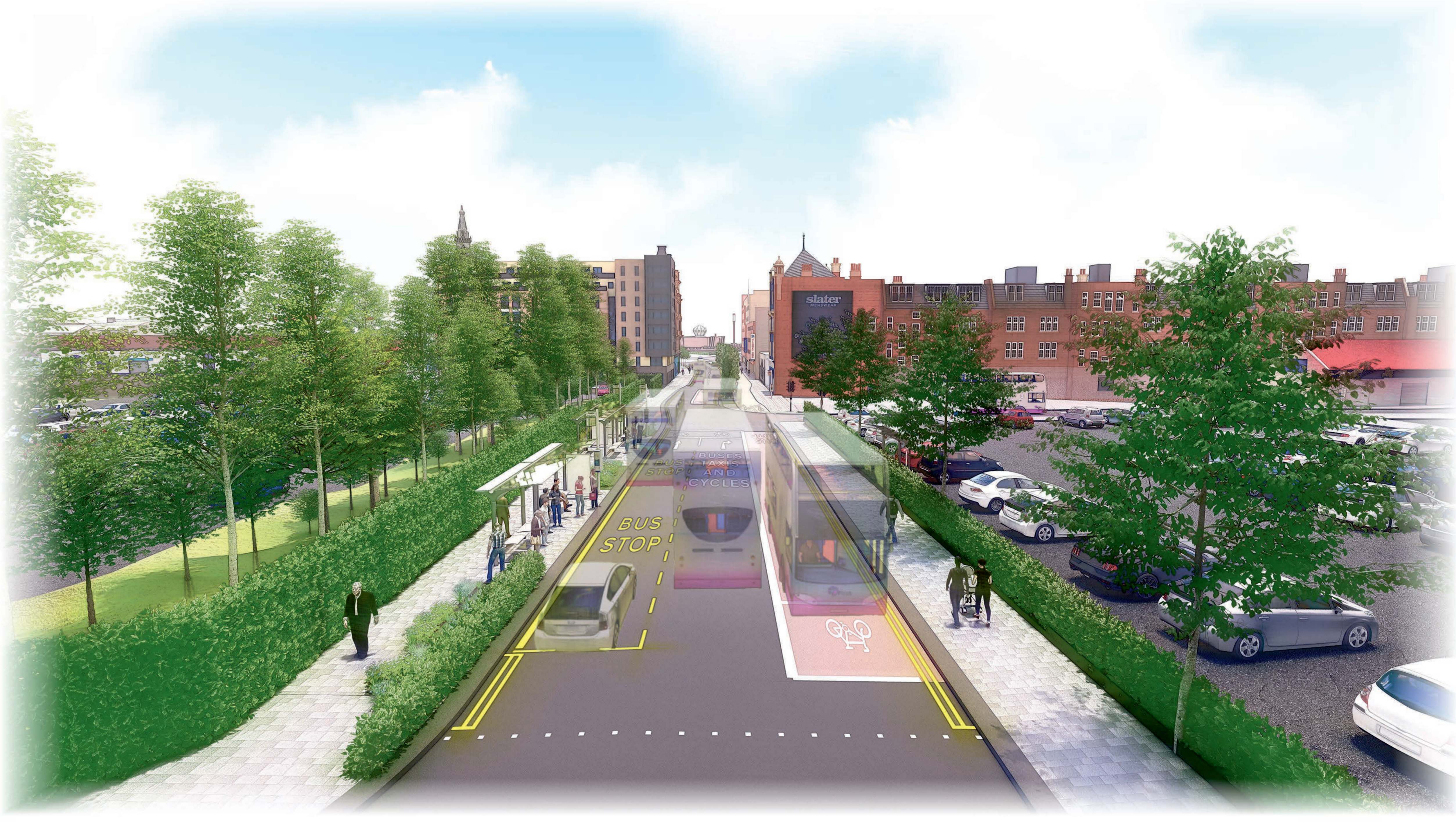
Zone 2: View looking south on Stockwell Street