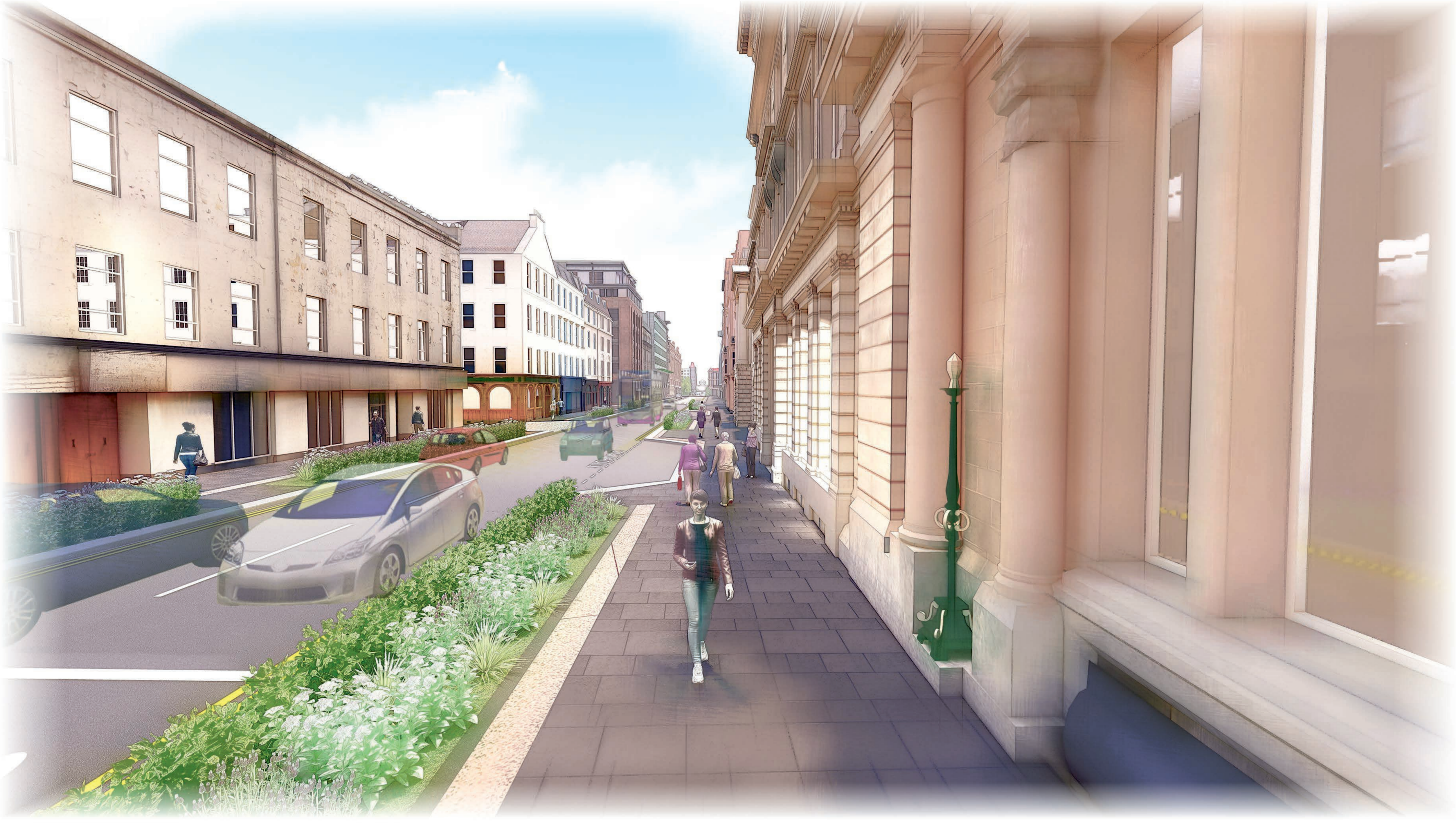
Zone 1: View looking south on Glassford Street