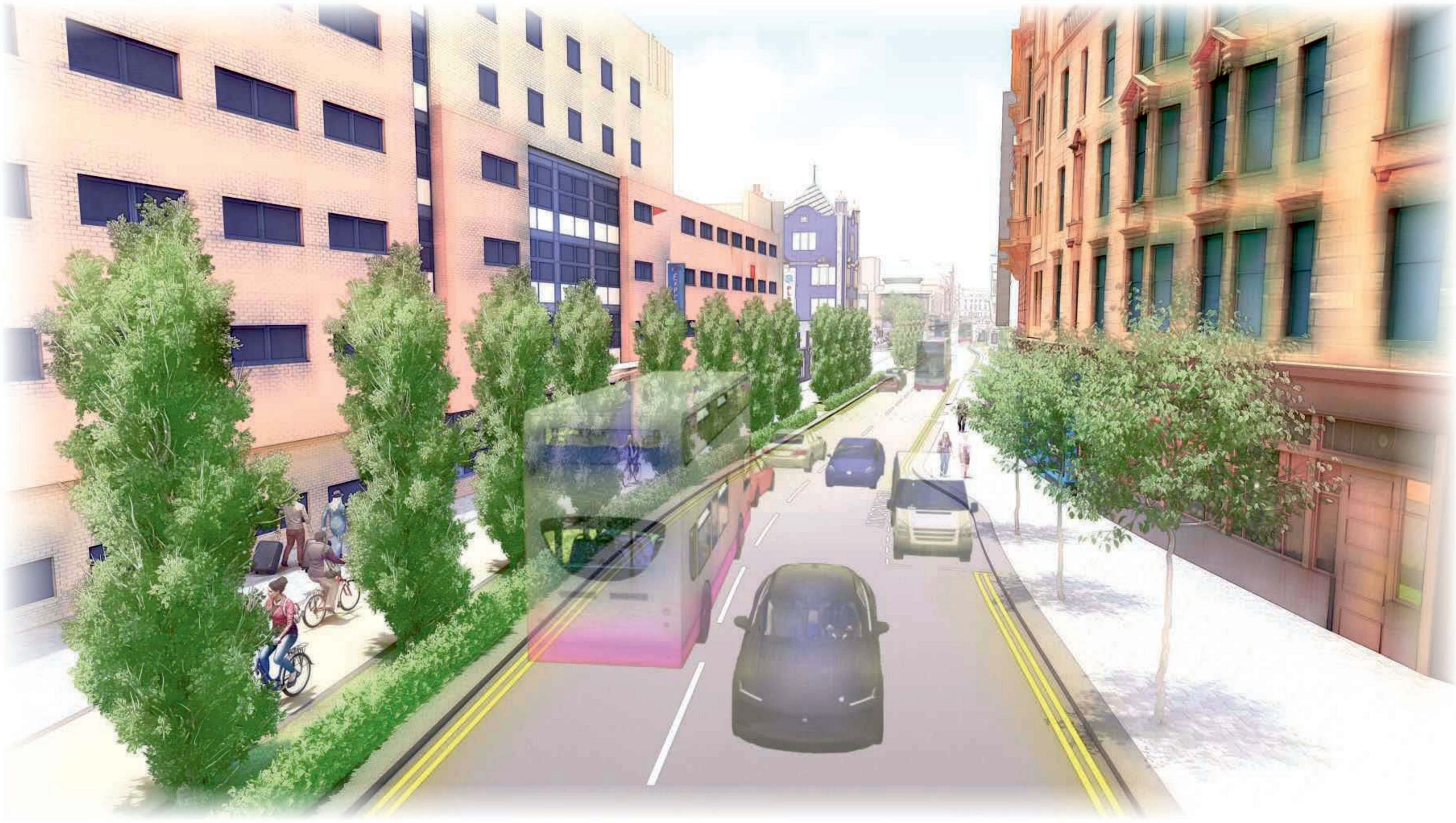
Zone 3: View looking north on Stockwell Street

Representation of City Deal investment. This image is an illustration of potential investment and not the final design.