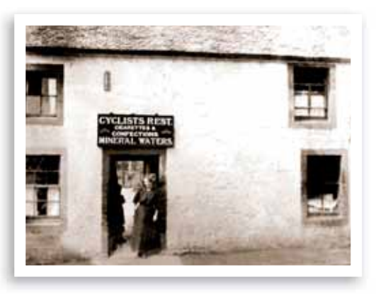
2 Kirk Road, The Cyclist's Rest, 1915 (Nell McNivens)

Turning south towards the Cross is Kirk Road. This part was known as Main Street until the 1920s and has on its west side an interesting row of two-storey cottages. The group of houses was built as a tenement for mill workers in 1798 and later included a popular confectioner's shop, the Cyclist's Rest.