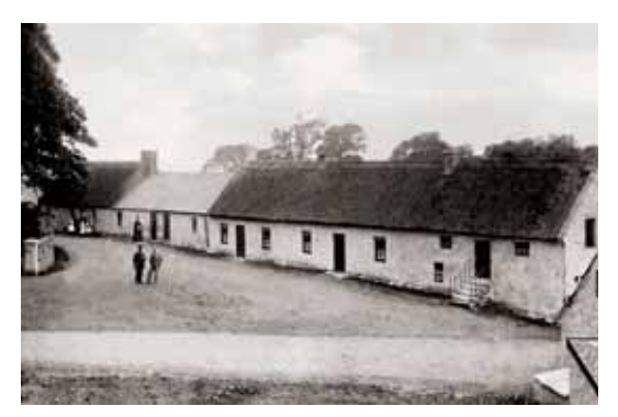
Manse Road, c.1906 (School Loan. The original schoolhouse has been re-roofed, the other cottages are still thatched)

Manse Road was earlier known as School Loan. Both names indicate the historic purpose of this area. On the south side of Manse Road, the 19th century stone gateway to the manse survives, although the manse, built around 1837, was demolished in 1966. The present manse is in Waterside Road.