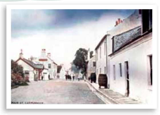
(Main Street) Kirk Road