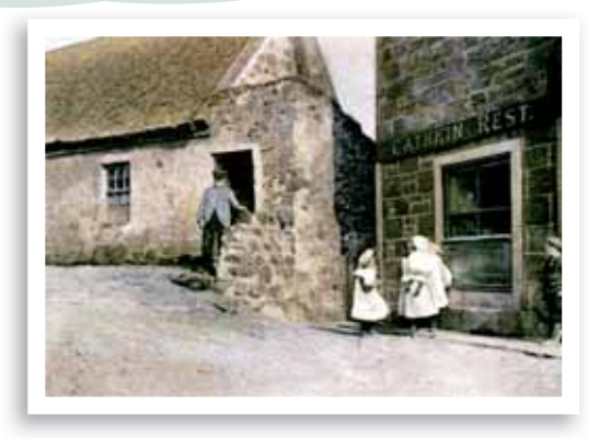
Bishop Cottage and Cathkin Rest