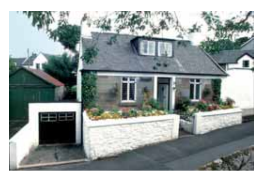
Kirk Road, Kirkennan Cottage (used as the Post Office from the 1890s to early 1900s)

South of the Cross, still in Kirk Road and opposite the Church, is the two hundred year old stone-built cottage known as Kirkennan Cottage. From the 1890s until the early years of last century, this was the Post Office. The back garden wall, on Manse Road, marks the west gable and fronts of two 18<sup>th</sup> century cottages, the roofs of which were removed in the 1950s. This area around the Church which included a number of such old cottages now gone, was, as shown earlier, referred to as the common town or kirkton .