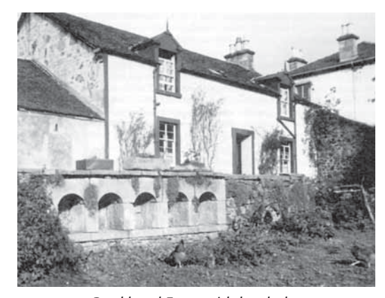
Bankhead Farm with bee boles

Bankhead Farmhouse stands back from Busby Road and dates from 1760. It was, until a few years ago, fronted by a very fine row of stone bee boles, built in 1762. These have now been moved to a private site in the village. In the 18<sup>th</sup> century, honey would have been a luxurious supplement to food, thus bee boles were built to protect bee skeps or hives from harsh weather. Few examples remain intact.