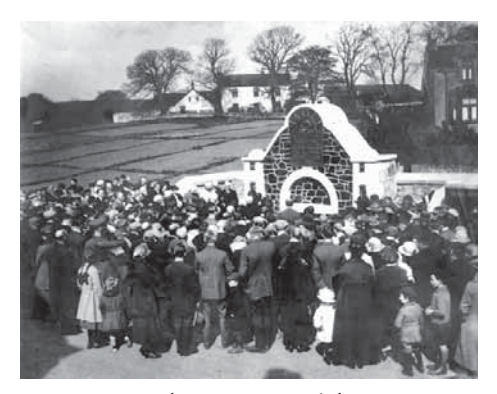
The War Memorial

The Memorial also lists the names of the nine men of the Parish who were killed in the Second World War.