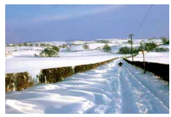
Countryside and Carmunnock (Kittochside Road, looking east from the top of the hill)

In 1938, the lands and mansion of Castlemilk were finally bought by Compulsory Purchase Order by Glasgow Corporation for the purpose of building housing. The mansion was later demolished. There remains a handsome old bridge and the beautifully restored stables which were located in the policies of Castlemilk House.