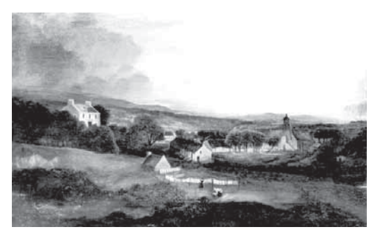
Old view of the village

Carmunnock is the only remaining identifiable village within the City of Glasgow boundaries. It lies five miles south of the city centre and is surrounded by green belt land. The old part of Carmunnock Village was declared a conservation area in 1970.