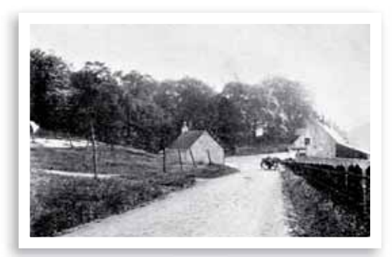
Cathkin Road Toll House

The Low Green is a public area with spring blossoming trees. The site of an old well is marked. These Greens were traditionally used by the village washerwomen as drying and bleaching fields. The Village Gala Queen is now crowned here.