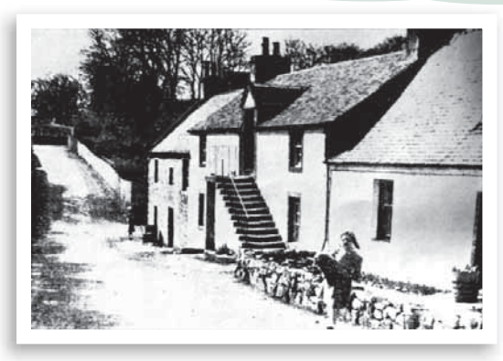
Brae House (Building with staircase is no. 32 Brae House, c.1690's)