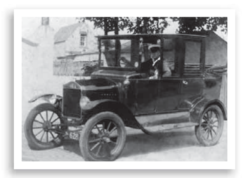
Stephen Young's taxi

A carrier's business was set up in the steadings around the beginning of the 20<sup>th</sup> century, collecting and delivering the village washerwomen's laundry from and to Glasgow.