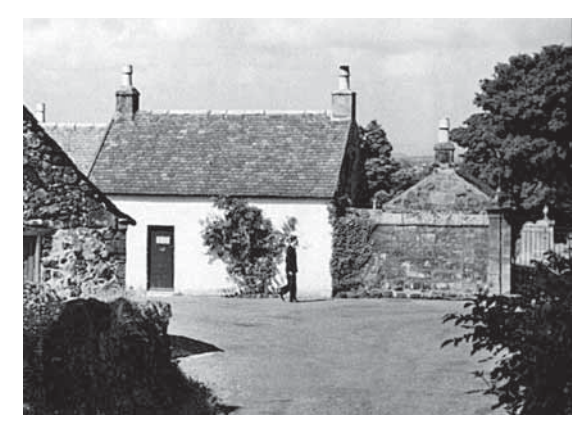
Old cottages, Kirk Gate, c.1935-45

Close to the Church gates, there are two small cottages at no. 22 and no. 24 Kirk Road. These date from the 17<sup>th</sup> century, although the lintel of no. 24 shows a later date. Of special interest at no. 24 are the shutter hinge-pins secured on the wall outside the window. These may date from a time prior to affordable glass panes. However, in the late 17th century, the upper sash of small windows was often glazed, with hinged shutters on the lower part. It was also the practice in some areas to remove a valued glass pane and carry it to the next home.