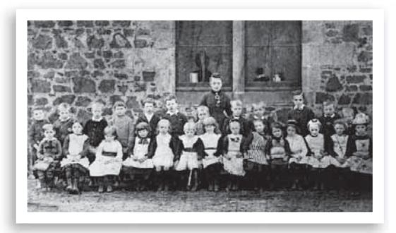
School group 1889

Beyond Sunnybank, on the east side of Waterside Road, stands the second of the former parish schools. It was built about 1840 to replace the first school in Manse Road. It was adapted and modernised in 1870 to accommodate the schoolmaster on the top floor. In 1904, when high airy rooms and tall windows were deemed important, the school was extended and made single-storey. In 1973 the new round Primary School was opened and the old school became the Village Recreational Club.