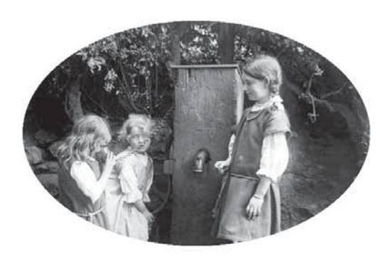
Well, Busby Road – Halla' Well

Because the Doo Well still retained its pump and a steady flow of water into the trough, a grant was obtained by Carmunnock Preservation Society to restore the pump. This was achieved in 1996.