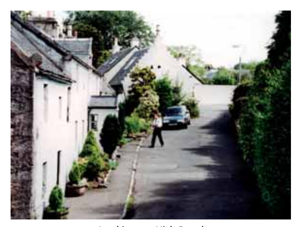
Looking up Kirk Road

Until about 1900, the house was thatched. It has now been divided into two separate dwellings.