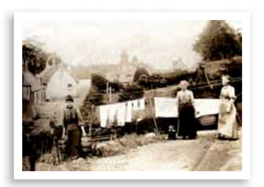
Washerwomen at Pathhead Cottages

Further west, on the high ridge, is Crag Lodge built in 1849 and the mansion house, the Craigs, designed by the eminent Glasgow architect James Sellars in 1880.