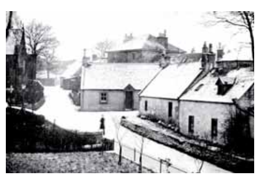
The Village Cross (From Busby Road looking towards Clason Hall on left and Craigenputtock on right)