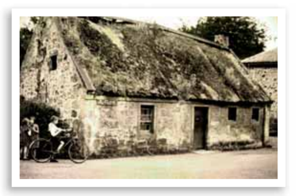
The last thatched cottage in the village

The conservation area is characterised by its domestic architecture, cottages of one or two storeys, and tenements. The traditional Scottish cottages are rectangular in shape, originally with turf-thatched roofs. Straw would have been used rarely as considered too valuable for animal welfare. The thatch was secured by ropes tied around the chimneys. It was tucked under the coping stones to keep it clear of sparks. Walls were of rubblestone covered with harling, with doors in the centre front. Fireplaces were placed at the gables with stout chimneys. The gables were crow-stepped and dormer windows appeared in the more prosperous dwellings. Tenements in the village were provided for mill workers and these would have outside stairs to the upper dwellings. Ornamentation on cottages and tenements was spare, shown possibly on doorways, gable roof-ends and gateways. Doors opened with a latch, hinges were iron made by the local blacksmith. Windows were part-shuttered as glass was rare and valuable. Farmhouses were improved throughout the 19th century and were solid, not ostentatious, as may be observed at Bankhead Farmhouse.