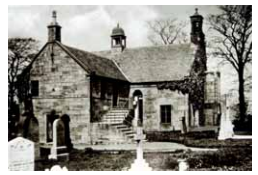
Carmunnock Church (facing north)

For many centuries the Church has been at the core of village life. The original church was built about eight hundred years ago. Before that there are indications of a tiny Christian settlement, possibly founded by Saint Cadoc in the 6th century.