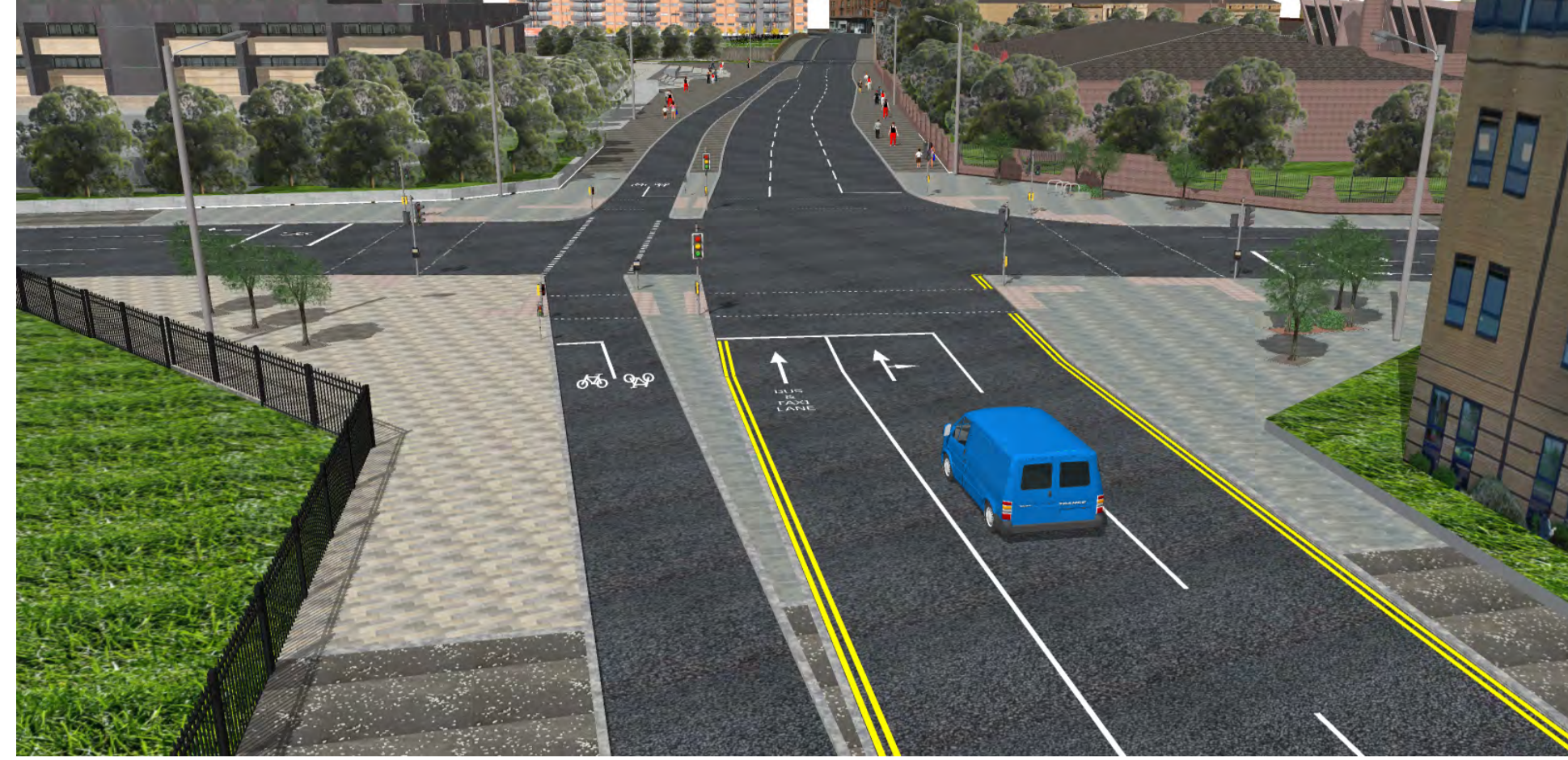
Developer Land, Materials may differ