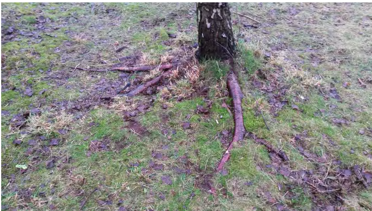
Photograph 2: Compaction and poor rooting medium has resulted in poor rooting throughout the site leaving the trees vulnerable to windthrow.

structure. All leaf litter should be left on site (within the woodland areas) or composted and returned to the root zones of the trees.