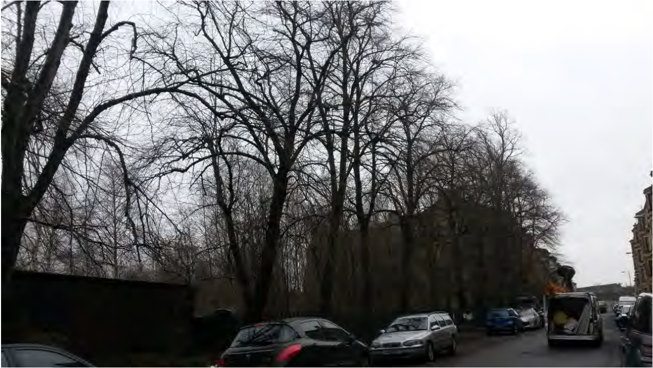
Photograph 1: Lime trees (Tilia x europaea) on the Clouston Street boundary protected by Tree Preservation Order

The established right of way passes through the root zone of tree 3999 and this has caused serious compaction within the root zone. Gentle cultivation with hand tools is recommended to aerate the soil followed by mulching and the addition of a thick layer of wood chip over the wearing surface to reduce further damage. In the long term it would be appropriate to consider installing a 'no-dig' ground protection system for the first 10m of footpath from the entrance to beyond the trees to minimise further damage (see, for example, http://www.groundtrax.com/ or http://www.terram.com/ ).