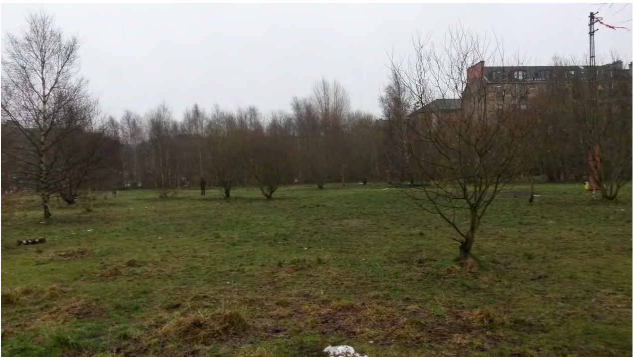
Photograph 7: Meadow area with willow natural regeneration

In order to maintain and develop biodiversity interest it will be necessary to mow the meadow areas. In the first year the emerging meadow should be cut to maintain the sward at height of 10-15cm (but not less than 5cm). Cuttings should be removed from the site to retain low fertility. In the second and subsequent years the meadow will require cutting at least once, preferably in late summer/early autumn once the plants have flowered and set seed. An occasional spring cutting will help to keep pernicious weeds (e.g. nettle, docks, dandelions etc.) and developing scrub in check, although hand pulling or spot spraying with an approved herbicide may be more suitable management for small meadow areas.