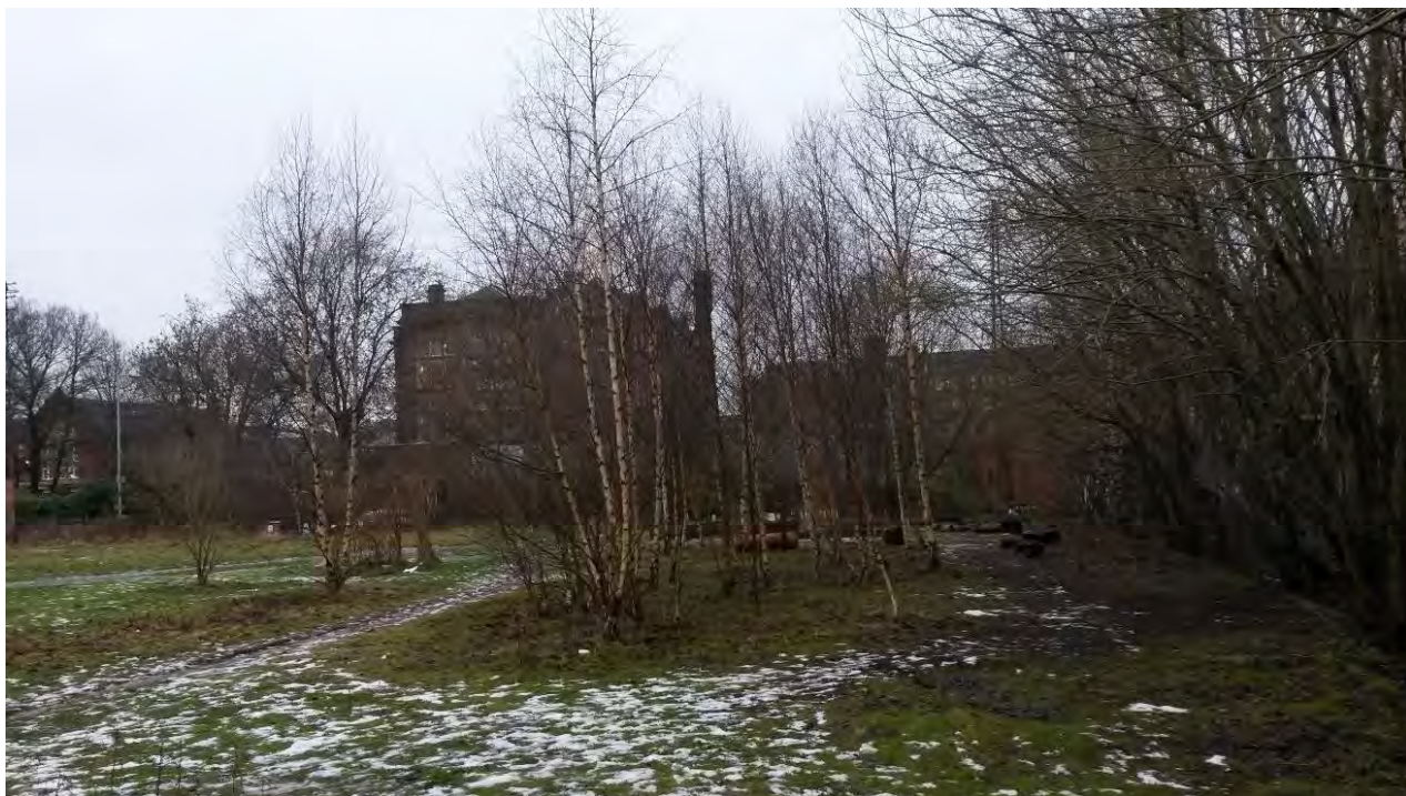
Photograph 5: Existing woodland in Compartment W3b