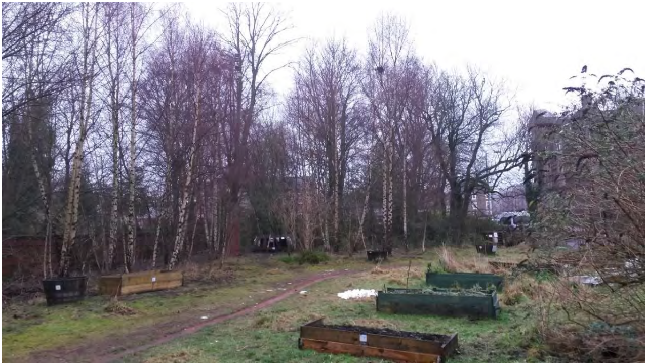
Photograph 3: W1 with community garden in the foreground

The ground vegetation in area W1 is becoming rank and dominated by aggressive weeds. The sward would benefit from some weeding, seeding and the introduction of a mowing regime (similar to that proposed below for the meadow). Some planting of (native) bluebells and snowdrops would be appropriate, particularly along the northern and western boundaries once the ivy and bramble is under control. Care should be taken to ensure that only native bluebells ( Hyacinthoides non-scripta ) are planted and not the invasive Spanish bluebell.