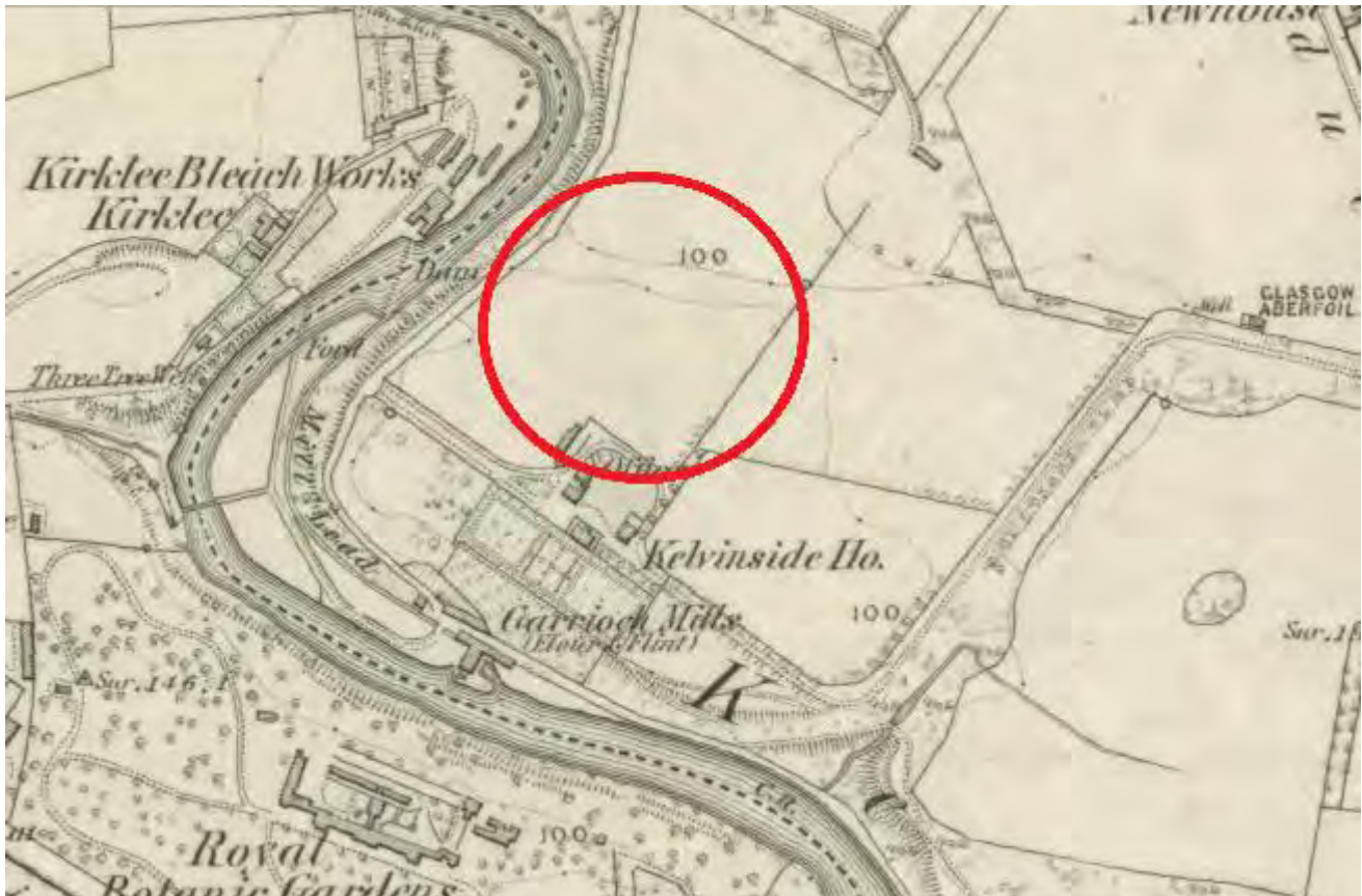
Map 1: 1 st edition OS plan (Dumbartonshire sheet XXVIII), published 1864) showing the approximate location of the site circled in red (from http://maps.nls.uk/ )