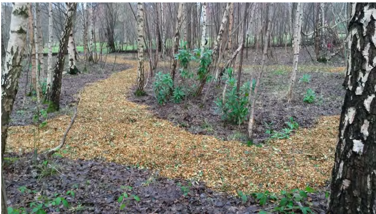
Photograph 6: Work is progressing to delineate the path network through the site using woodchip

systems for heavily used footpaths and events areas could be considered or alternatively, on-going regular application of woodchip.