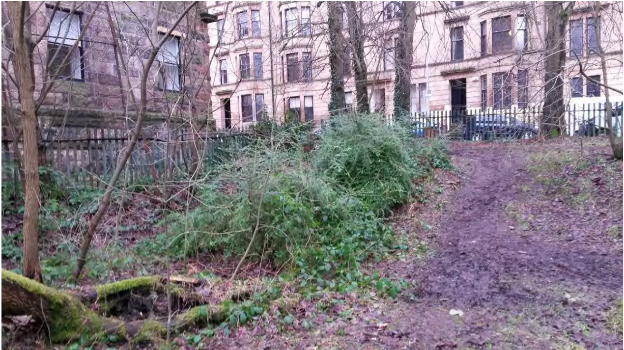
Photograph 4: Lonicera nitida , a garden escapee, in Compartment W2a

use of the area. Cultivation and mulching of the ground within the tree groups should be undertaken to improve soil conditions. Some supplementary planting with alder species would be appropriate in these groups following the specification in Appendix 3 provided suitable aftercare can be provided.