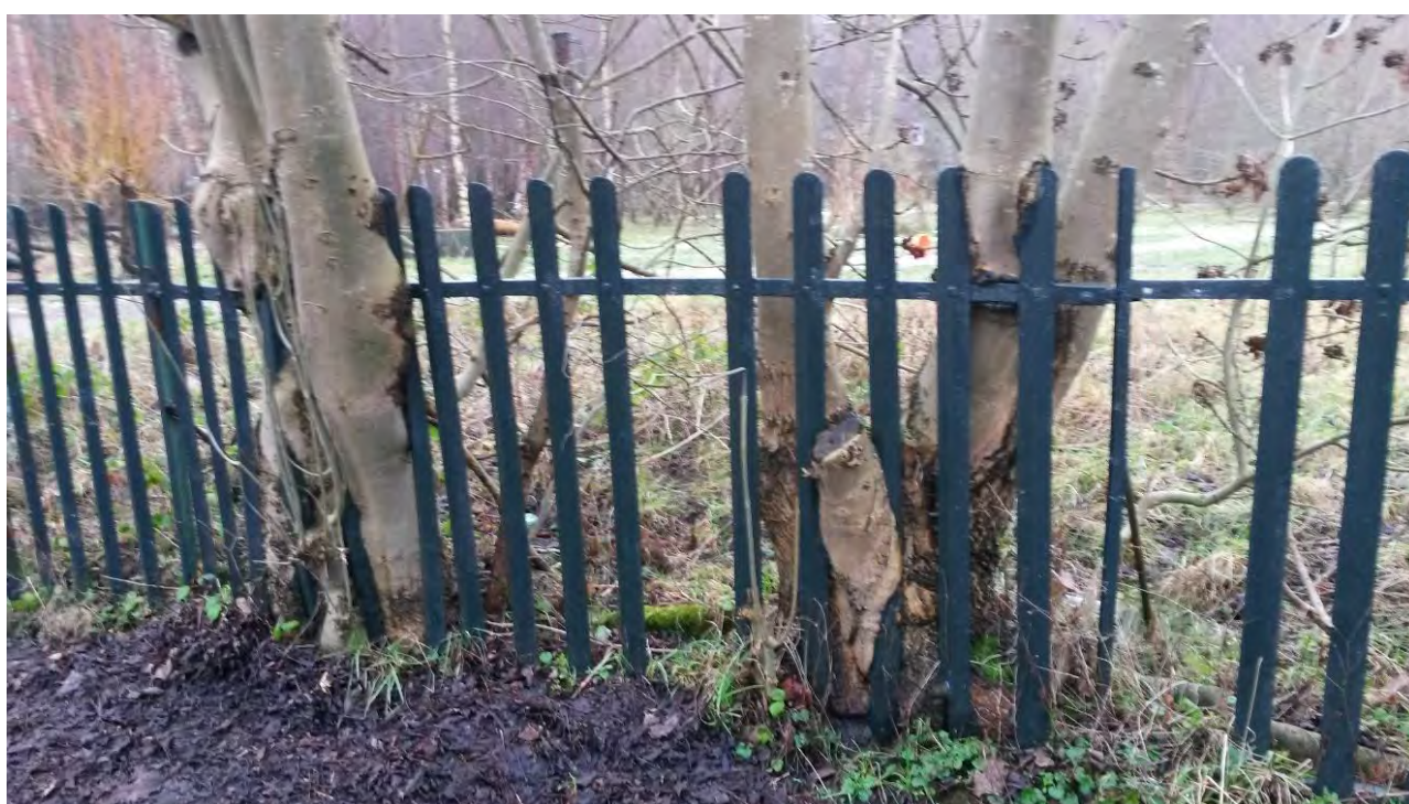
Photograph 8: Trees damaging the boundary fence on Kelbourne Street

The metal palisade fence which extends along much of the site boundary is a feature of the area, particularly the Clouston Street and Kelbourne Street boundaries. Most of the fence is still present on site but is being damaged in places by tree regeneration. The trees growing through the fence are generally poor specimens that are damaged to a point that they will have reduced life expectancies. The roots of some of the trees on Kelbourne Street are also damaging the pavement.