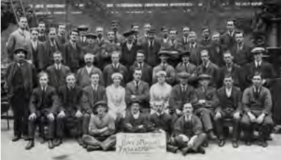
Beardmore Howitzer department, WW1