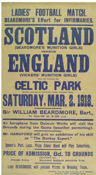
Celtic Park football match poster, 1918

Celtic Football Club was founded to be a football club for the Irish community in Glasgow and while there were members of the Irish community who disagreed with the war, many more enlisted in the British military. Celtic FC regularly supported charities through fundraising events such as the pioneering ladies football match played at the stadium on the 2nd of March 1918. This pitted women workers from the Beardmore munitions factory in Parkhead against their counterparts from Vickers in Barrow-in-Furness. A great match of Scotland versus England commenced with Scots unfortunately losing 4-0. In September of the same year, 22,000 attended a sports day to raise money for hospitals in France and each week servicemen would be admitted free to home matches. On another occasion an