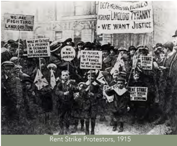
Rent Strike Protestors, 1915

Opp. 125 Greenhead Street, Glasgow G40 1HT