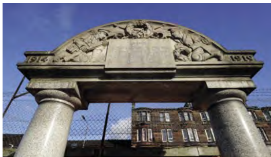
Duke Street Station Memorial, 2013

Duke Street Railway Station, Glasgow, G31 1LL