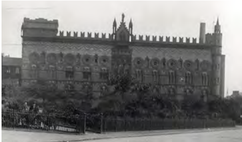
Templeton's Carpet Factory, 1914