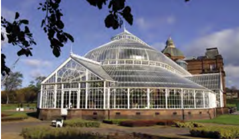
People's Palace, 2013

The jewel in Glasgow Green's crown is the magnificent People's Palace and Winter Gardens. This museum exhibits many items related to the history of Scotland and Glasgow specifically, with a focus on social history. The current lineup of exhibits includes First World War Posters as well as