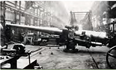
Beardmore Naval Gun, WW1

William Beardmore & Company was a powerhouse of Scottish industry, an engineering conglomerate of vast proportions. The company's Parkhead Forge, in conjunction with the Govan and Dalmuir shipyards made a huge contribution to the war effort through the manufacture of warships, tanks, aeroplanes and guns. 3500 field guns, 69 ships totalling 118,089 tons and the British army's steel helmets were just some of the fruits of the organisation's labour along with the track shoes and armour plates for the nation's tanks. As production boomed, so did the workforce and by 1915 the Forge