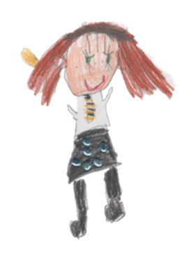
Peter Politeness Rebecca Responsibility