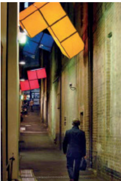
Abercrombie Lane, Sydney

If you are successful you will receive a letter including the conditions of grant which should be signed and returned.