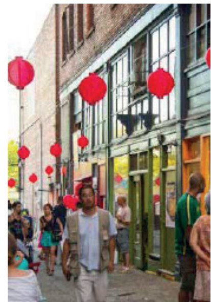
Seattle Lane exemplar

That fact that your application has been successful does not mean that the required fees, licencing, permits, planning permission or approval for lane closure is granted. All relevant regulatory or statutory steps still need to be taken.