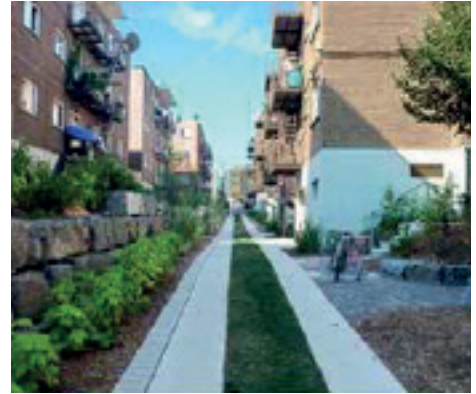
Examples of images representing aspirational exemplar work in lanes from many international locations