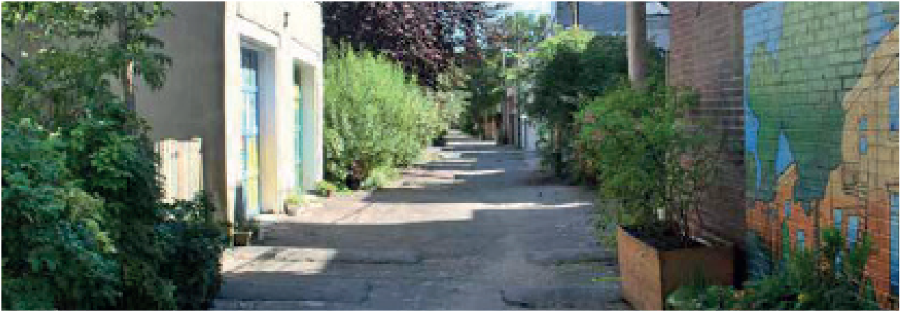
Ruelle Verte, Plateau Mont Royal, Montreal