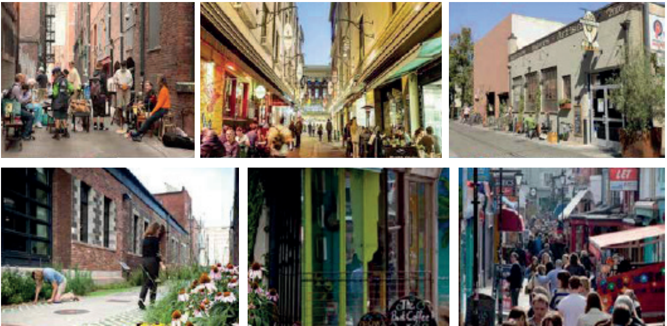
Examples of images representing aspirational exemplar work in lanes from many international locations